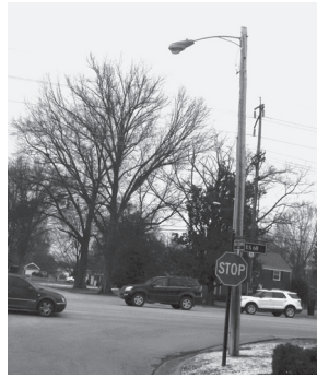
Old Wood Pole being replaced