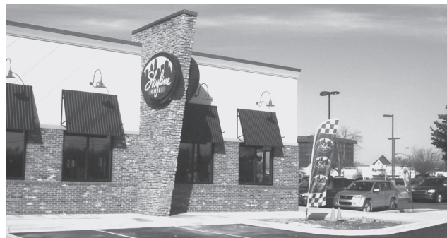
New Site located off Whittington Pkwy – facing Hurstbourne

Skyline Chili opened for business at its new Hurstbourne location next to BB&T Bank at the corner of Whittington Parkway and Hurstbourne Parkway. As part of the celebration of the arrival of Skyline Chili to the City of Hurstbourne, City Officials participated in the grand opening ceremonies. In fact, the City Commission declared January, 28, 2016 as “Skyline Chili Day” in Hurstbourne. Stop by and welcome our new corporate resident to our community.