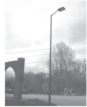
New Metal Light at S. Chadwick

New lights and fixtures are being installed at key intersection locations in Hurstbourne. Old wooden poles, cobra-style lights and wires are being replaced with new metal posts and box style light fixtures. Depending on the lighting needs of the area, 250 or 400 watt bulbs illuminate over an 80 foot section of street surface below. The new lights will improve visibility for pedestrians and vehicle traffic.