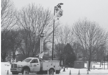
New Light installation on Marksfield